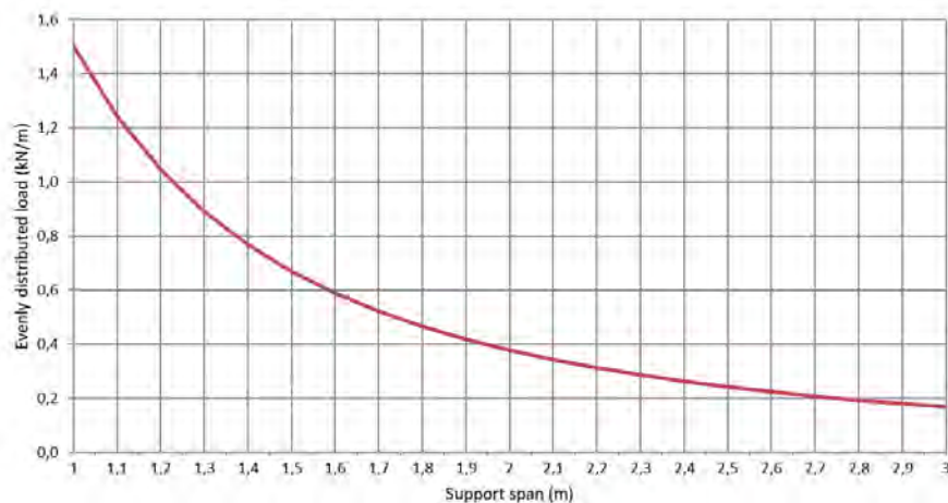
Permissible load KP 60/200 d=0,6mm (kN/m)